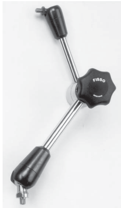
SMALL FISSOFLEX - ARM ONLY Arm - 1000