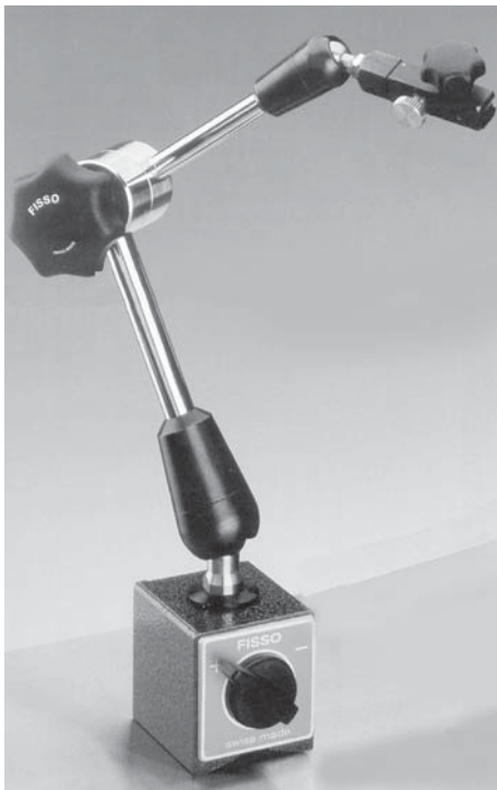
LARGE FISSOFLEX - ARM ONLY Arm - 3300